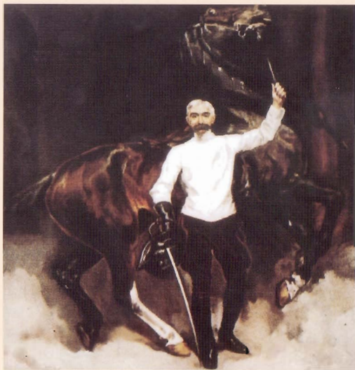
PIERRE DE COUBERTIN